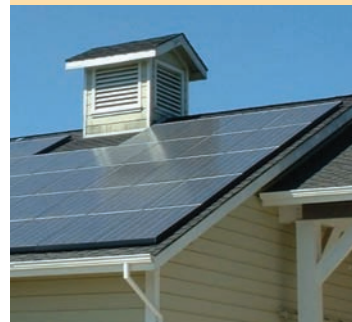
Black frame and low profile racking complement roofline.