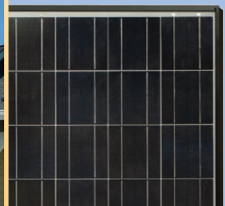
Laminated glass construction in a high torsion frame.